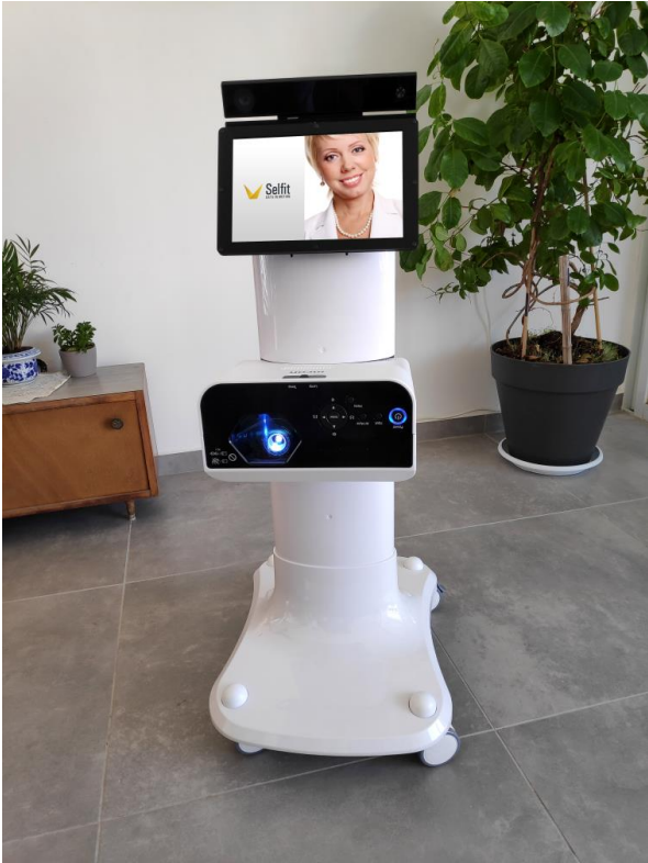
Hospitals / Clinics Care/Private Homes

Neurological/ Dementia/ Cognitive Cardiovascular Wellness/ Prevention Orthopedics COPD